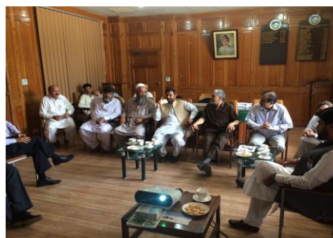
Minister LGRD agreed on DSP Board