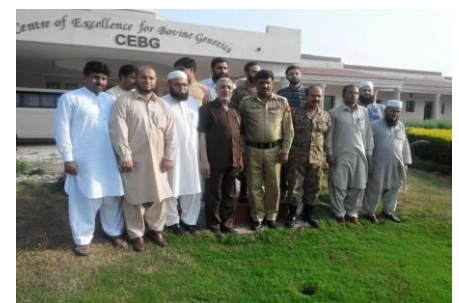
Dairy Science Park team and CEBG officers

farmers and practitioners under the Park. The DS Park team offered collaborative research programs for introducing techniques like marker assisted selection, identify animals of better genetic worth regarding milky yield, disease resistance and fertility traits in their earlier part of life.